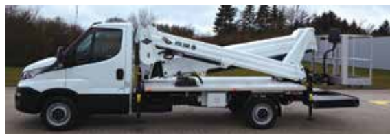
Available on 3.5T GWV Mercedes Sprinter and 3.5T and 5.2T Iveco Daily