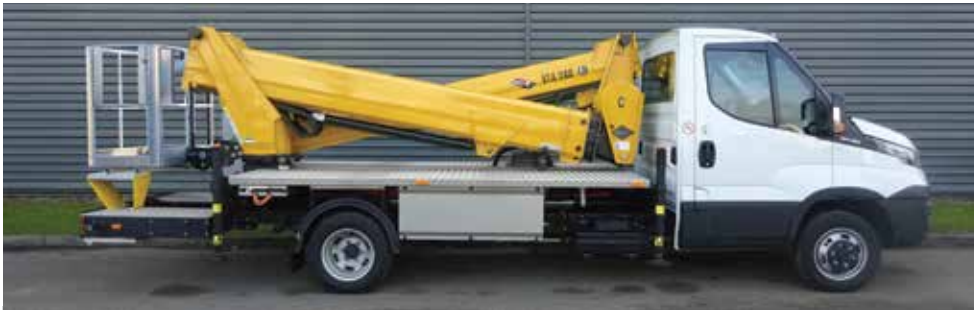
Low travel height