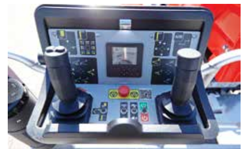
Easy to use full proportional (FPC) CANbus controls with display