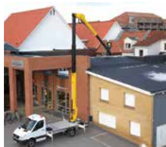
The ability to work over rooftops to access difficult to reach areas is aided by a flat bottomed basket