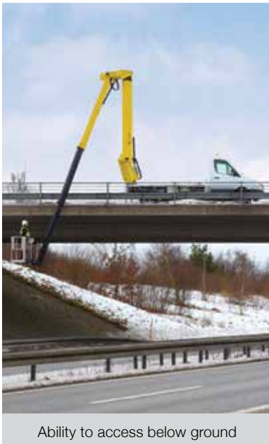
Ability to access below ground