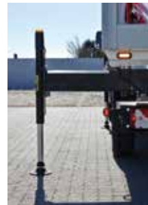
Compact H-frame outriggers